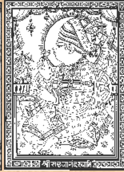
॥ શ્રી સ્વામિનારાયણ ભગવાન ॥