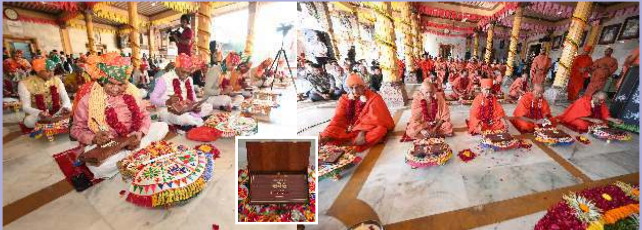
A Novel Experiment: Saints and host devotees writing the "Samaiya" (festival) invitation cards in the Sabha Mandap.

Registered under RNI - No - GUJENG/2007/20198 " Permitted to post at Ahd PSO on 11 the every month under postal Regd. No. GUJ. 582/2024-2026 issued SSP Ahd Valid up to 31-12-2026