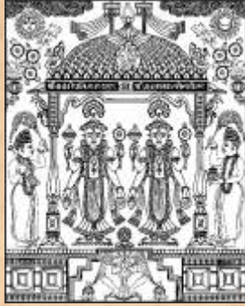
॥ શ્રી નરનારાયણ દેવ ॥