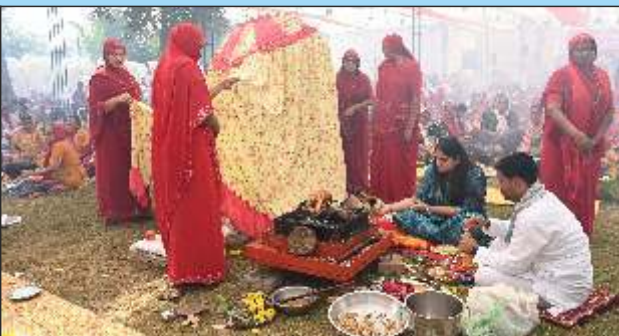
With the pious Sankalp and presence of H.H. Shri Gadiwala, thousands of female devotees offering Samigh (oblations) into Yagna(the sacred fire)alongwithH.H. Shri Shri Raja at the Jamiyatpura Temple as a part of celebration of Samaiyo.