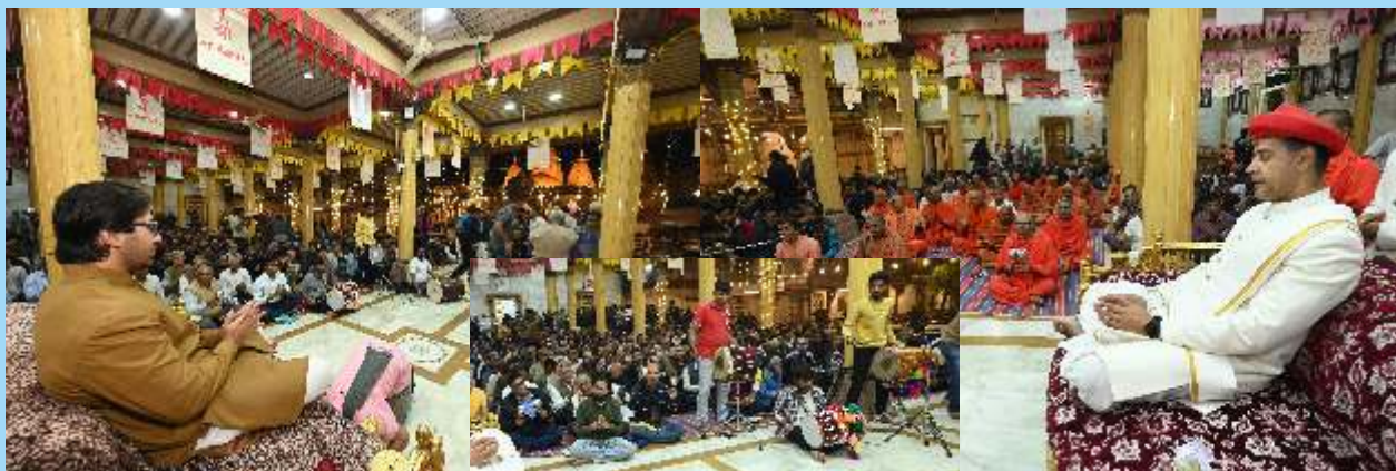
H.H. Shri Acharya Maharaj and H.H. Shri Lalji Maharaj performing chantsDhoon with thousands of devotees early in the morning during the piousDhanurmas Dhoon famous in Sampradaya at Kalupur Temple.