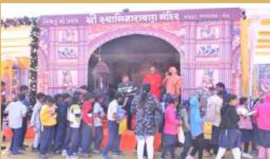
Glimpse of our Kalupur temple at Hindu Spiritual and Service Fair at G.M.D.C. ground, Ahmedabad.