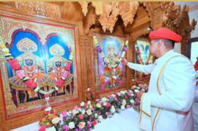
H.H. Shri Acharya Maharaj performing Murti-Pratistha in the temple of ladies devotees at Godhavi.