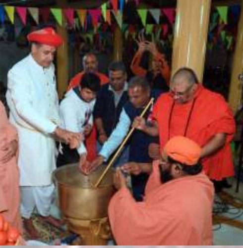
H.H. Shri Acharya Maharaj performing Shakotsav during Dhanur Maas in Ahmedabad temple and devotees taking Prasad with great discipline in the Chawk of the temple.

Registered under RNI - No - GUJENG/2007/20198 “ Permitted to post at Ahd PSO on 11 the every month under postal Regd. No. GUJ. 582/2024-2026 issued SSP Ahd Valid up to 31-12-2026