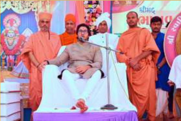
H.H. Shri Lalji Maharaj granting blessings in the Sabha at Mahij village.