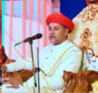
H.H. Shri Acharya Maharaj granting blessings in Dangarva temple.