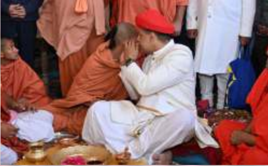
H.H. Shri Acharya Maharaj performing Saint-Maha Diksha in Ahmedabad temple.