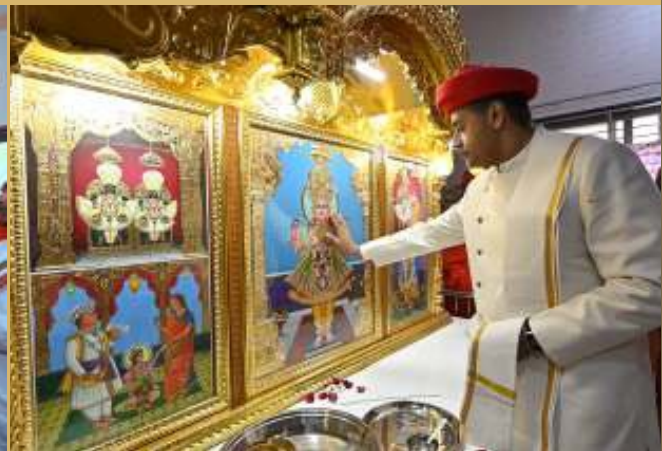
H.H. Shri Acharya Maharaj performing Murti-Pratistha in Bhavnagarpura (Kalol) temple.