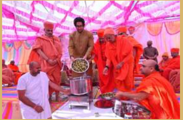
H.H. Shri Lalji Maharaj performing Shakotsav at village Ghamij.