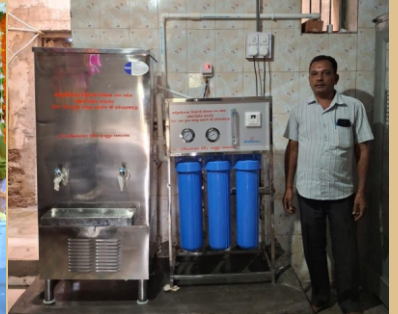
On the occasion of the Samaiyo, a water cooler was installed at the under-construction Nikol temple by our Kalupur temple.