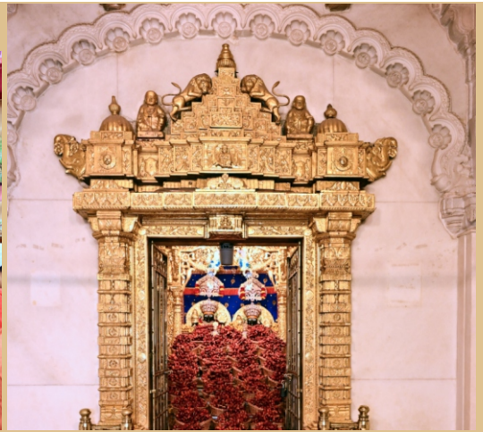
An Annakut (offering of food) of dates in front of Shree Narnarayandev.