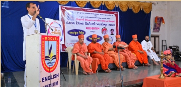
In celebration of the Samaiyo, a Bal-YuvaShibir(children-youth camp) and religious education competition was held in Mansa in the presence of the saints.