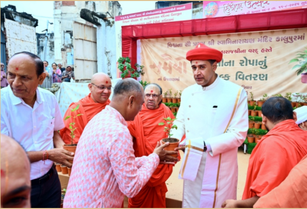
H.H. Shri Acharya Maharajshri distributing Tulsi saplings at Kalupur temple on the occasion of the Sameyo.